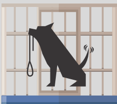
Boarding kennel/ animal hospital